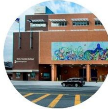
SUSTAINABLE LAND USE