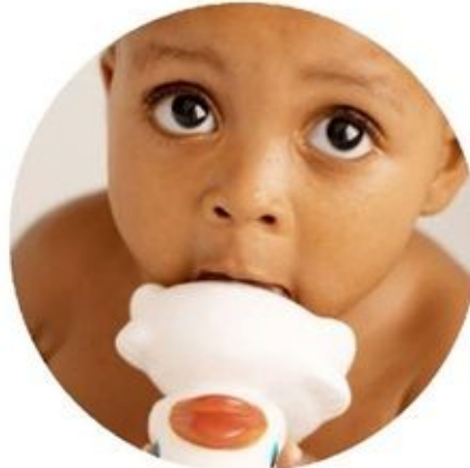
TOXIC FREE PRODUCTS