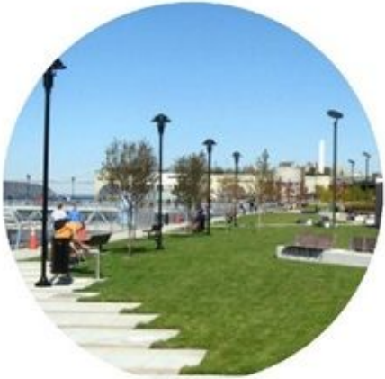
OPEN & GREEN SPACE