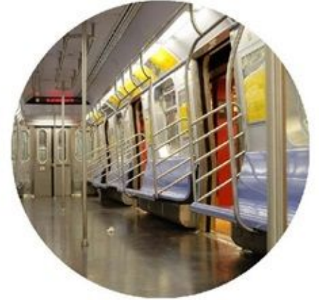
AFFORDABLE, EQUITABLE TRANSIT