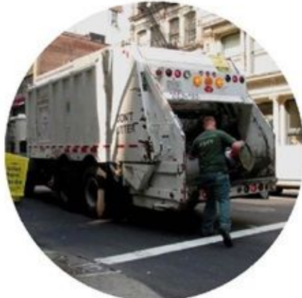
WASTE, PESTS & PESTICIDES REDUCTION