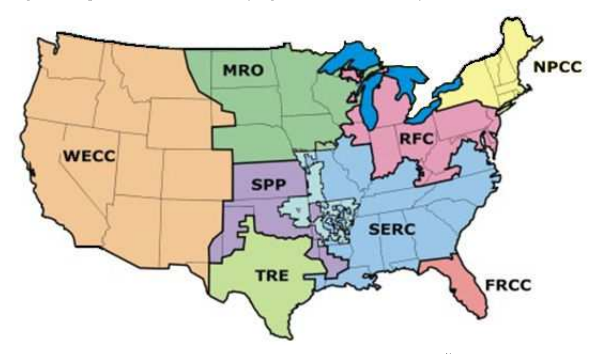
Figure 3: Map of NERC electric reliability regions (continental U.S. only).